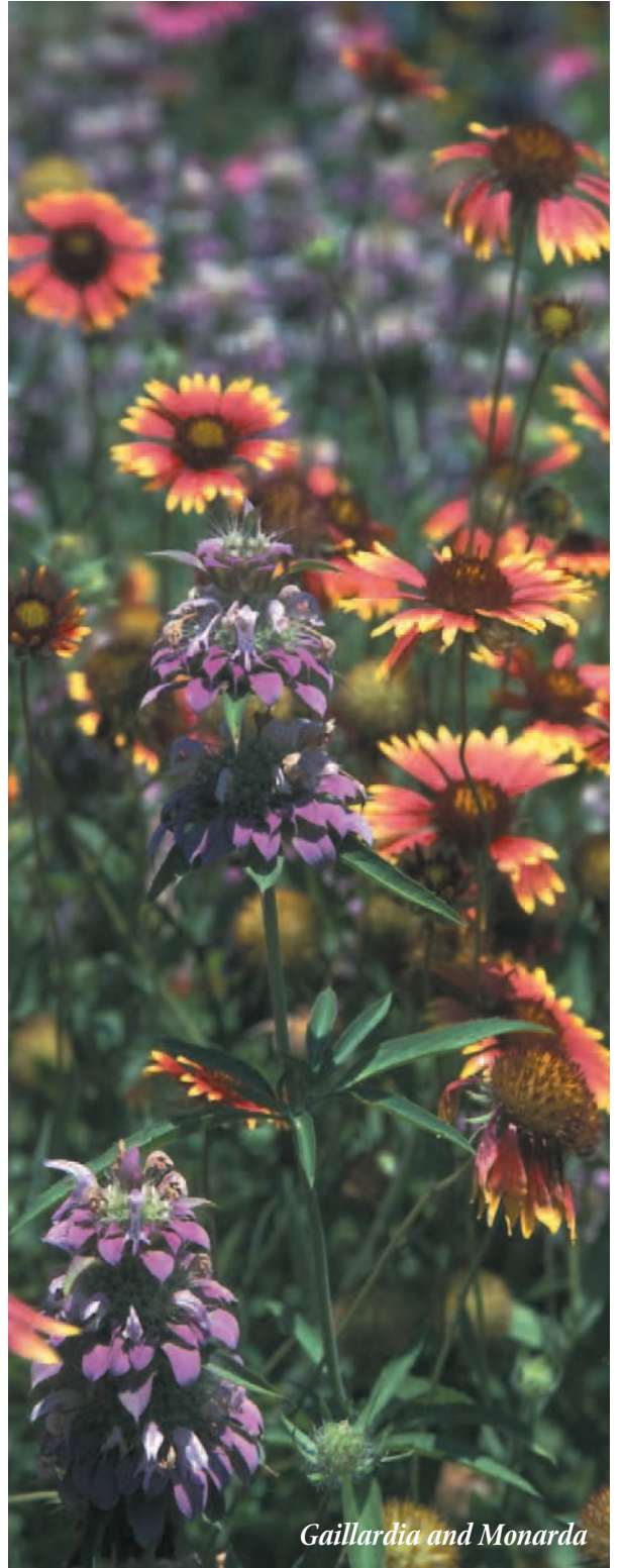
Gaillardia and Monarda